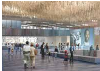
Learning Program and Facility Plan: Smithsonian: National Museums of African American History and Culture, Washington D.C., USA