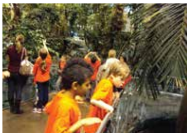
Exhibition, Urban Ecosystems Game, Biosphere, Montreal, Canada