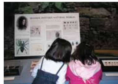
Traveling Exhibition, Peter Rabbit's Garden