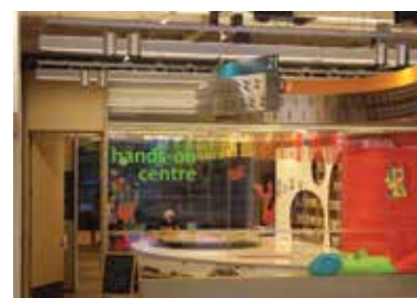
Facility Plan, Weston Family Learning Center Art Gallery of Ontario, Toronto, Canada