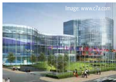
Business Plan, Hohhot Children's Museum, Beijing, China