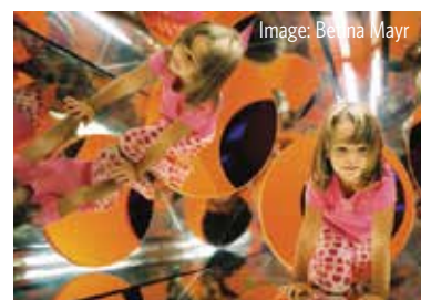
Feasibility Study and Development Plan: Zoom Children's Museum, Vienna, Austria