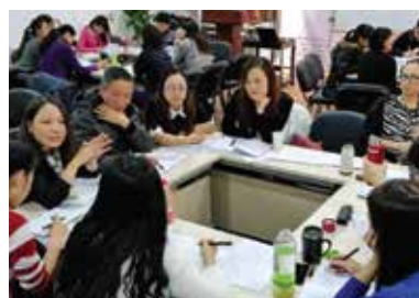
Training and Professional Development, Children's Museum Research Center, Beijing, China