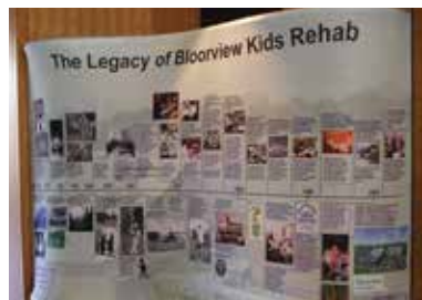
Exhibition: Bloorview Kid's Rehab Hospital, Toronto, Ontario