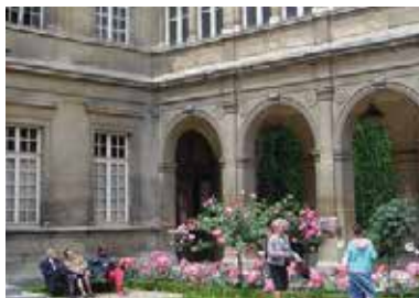
Visitor Study and Program Strategy: Musees ville de Paris, Paris, France