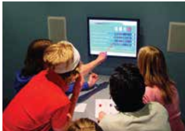
Children and Youth Experience: Parlamentarium, Brussels, Belgium