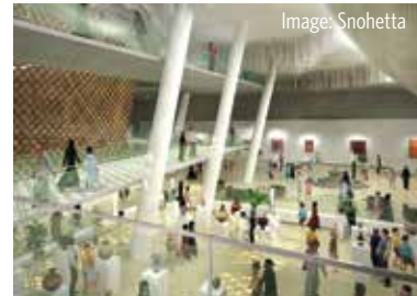
Program Plan, Children's Discovery Zone, King Abdulaziz Center for Knowledge and Culture, Dhahran, Saudi Arabia