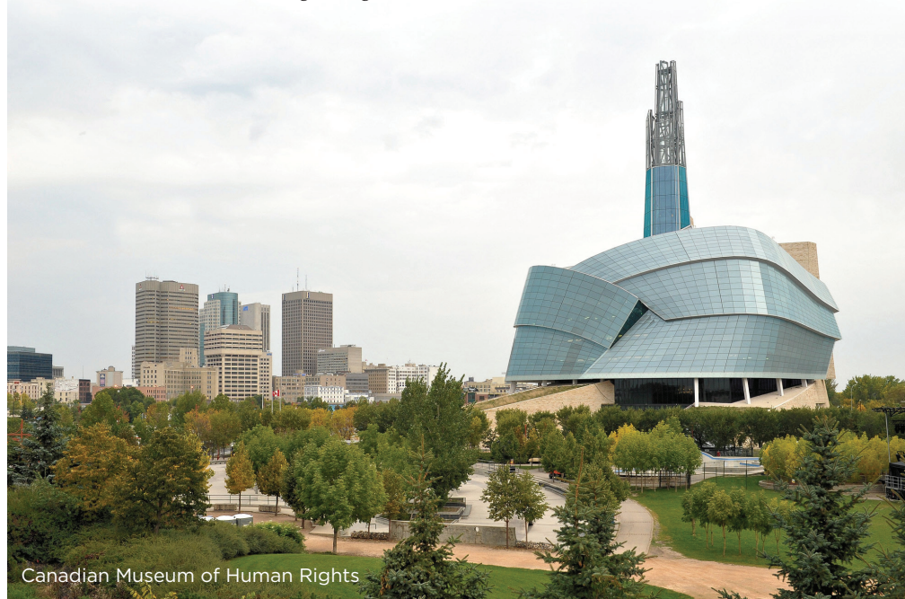
Canadian Museum of Human Rights

In the museum setting, these trophies became objects of curiosity, displayed to communicate ideas about power and the hierarchy of “civilizations,” so that there would be no doubt about the justice of “our empire” or the superiority of “our civilization.” The objects that had been gifts between rulers somehow validated the no-