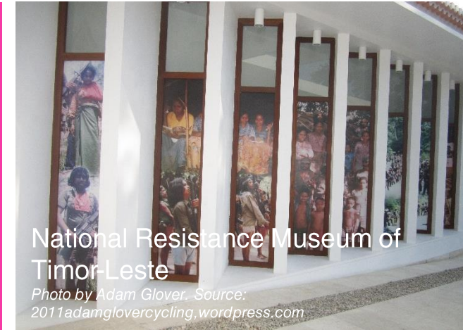
National Resistance Museum of Timor-Leste