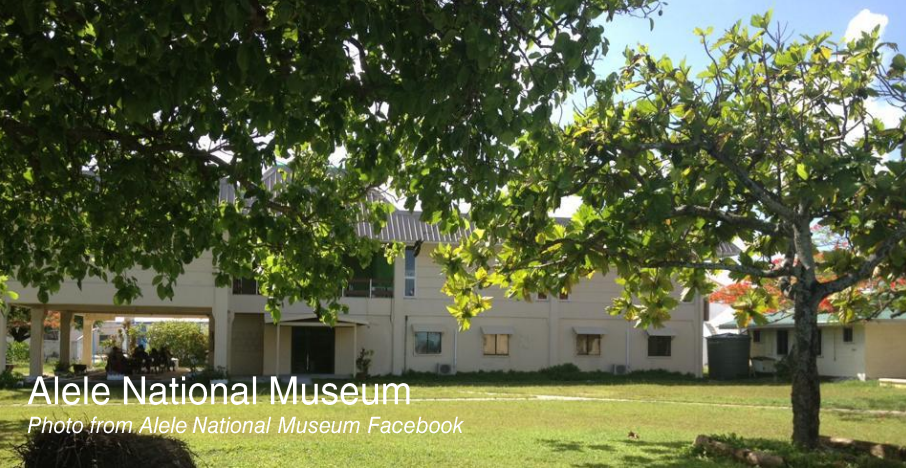
Alele National Museum