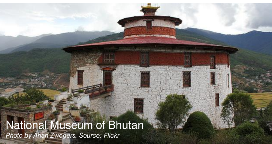
National Museum of Bhutan