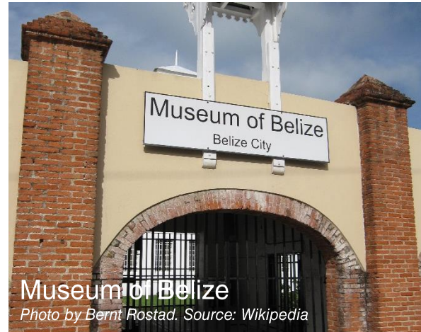
Museum of Belize