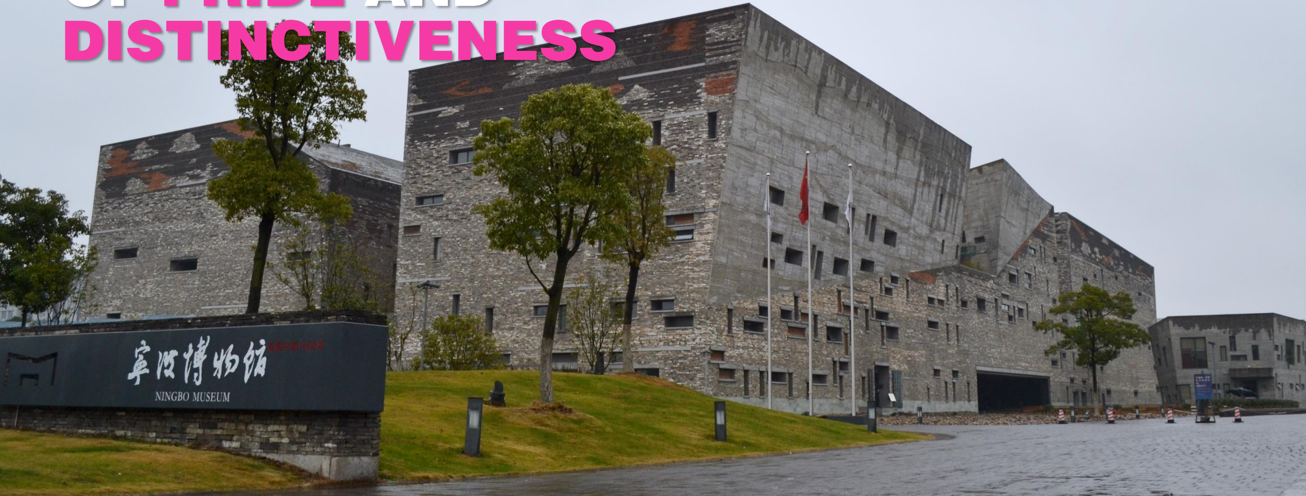
South gate of Ningbo Museum, designed by Wang Shu.