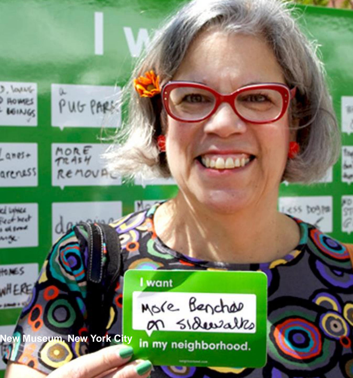
Community engagement by Neighborland at Ideas City Festival, New Museum, New York City