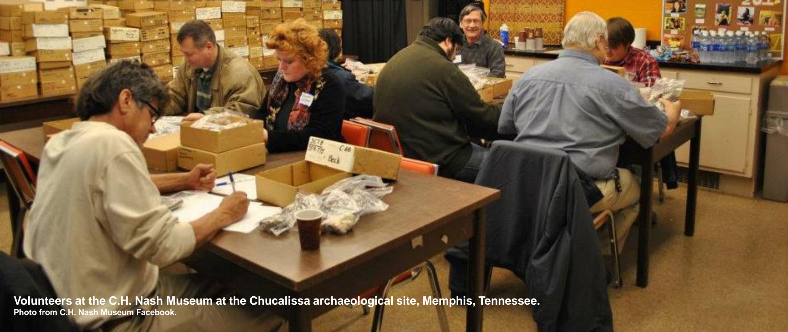
Volunteers at the C.H. Nash Museum at the Chucalissa archaeological site, Memphis, Tennessee.