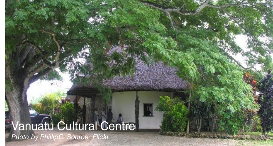
Vanuatu Cultural Centre