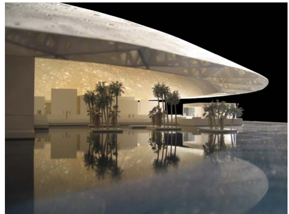
Model of Classical Museum by Ateliers Jean Nouvel